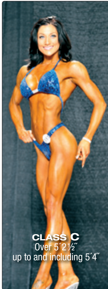
CLASS C Over 5'2½" up to and including 5'4"