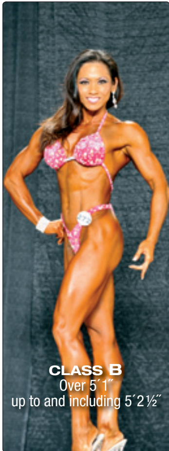
CLASS B Over 5'1" up to and including 5'2½"